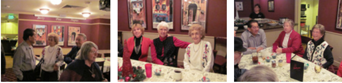
Christmas Dinner at Santeramo's—Italian Food and League Conversations